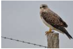
Swainson's Hawk