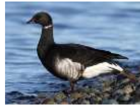
Pacific Brant